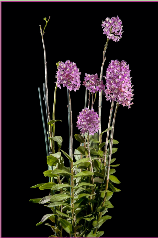
Epidendrum Candy Valley 'Andrea Lei' CCM HOS