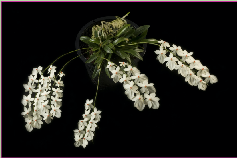
Aerangis rhodosticta 'Maikai' CCM HOS