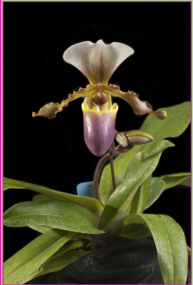
Paphiopedilum Calvert Sunrise 'Pacific Heights' CR HOS