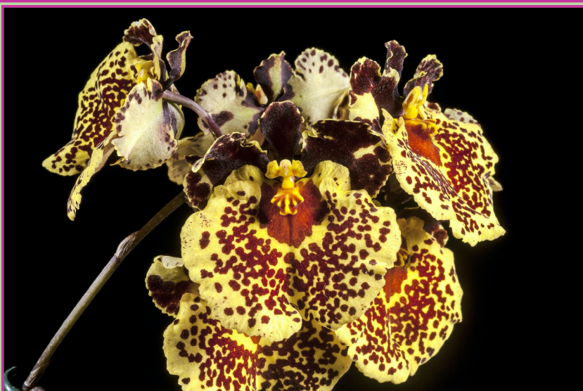
Rodrumnia Hello Kitty 'Pam'