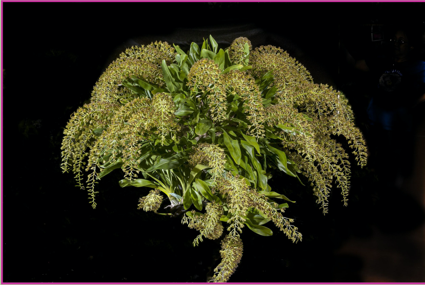
Grammatophyllum scriptum 'Son of Grasshopper'