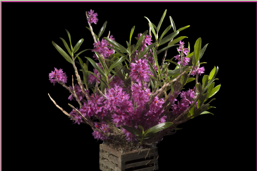
Dendrobium Hibiki 'Pink Elephants' AM/CCM HOS