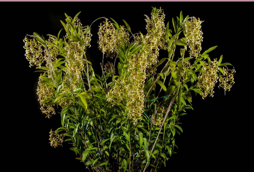
Epidendrum raniferum 'Ah Kew 100' CCM HOS