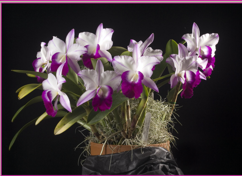
Cattleya Memoria Robert Strait 'Islander Delights'