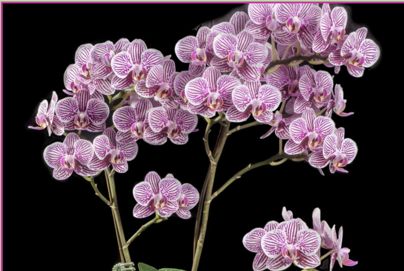
Phalaenopsis Taida King's Caroline 'Taida's Little Zebra'