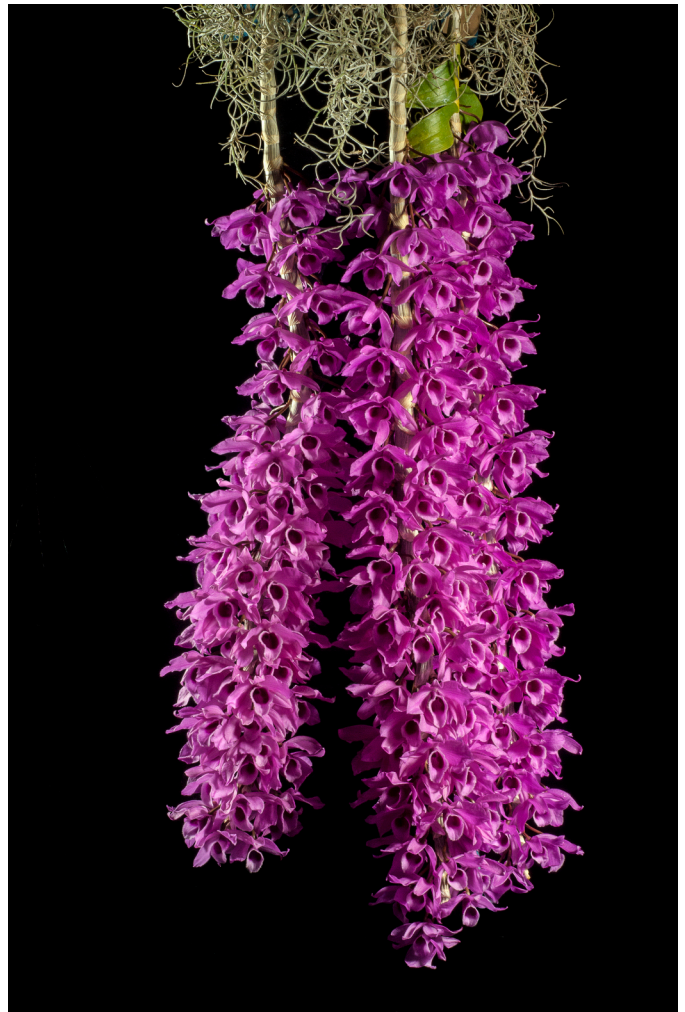
Dendrobium anosmum 'Purple Pride'