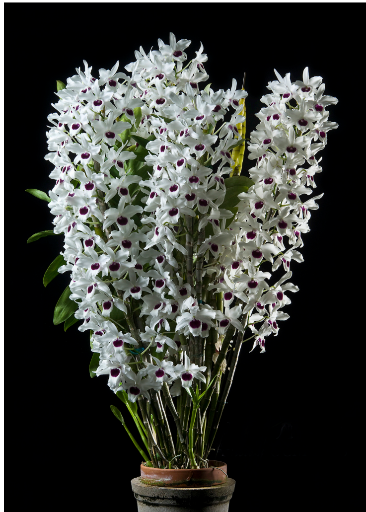
Dendrobium Forty Niner 'Susan'