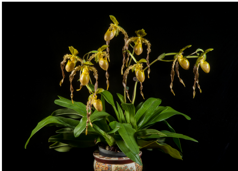
Paphiopedilum Oberhausen's Diamant 'Vi' CCM HOS (85.0 pts)