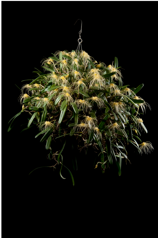
Bulbophyllum vaginatum 'Calvin Toshi Abe'