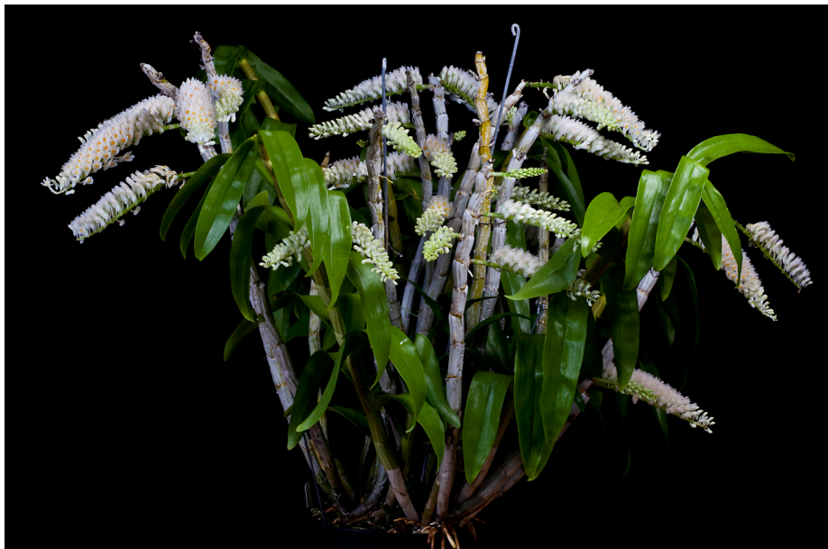
Dendrobium secundum var. album