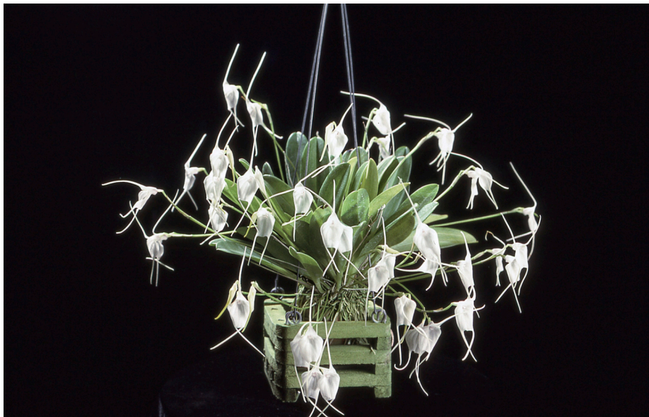
Masdevallia Snowbird 'Ginger'