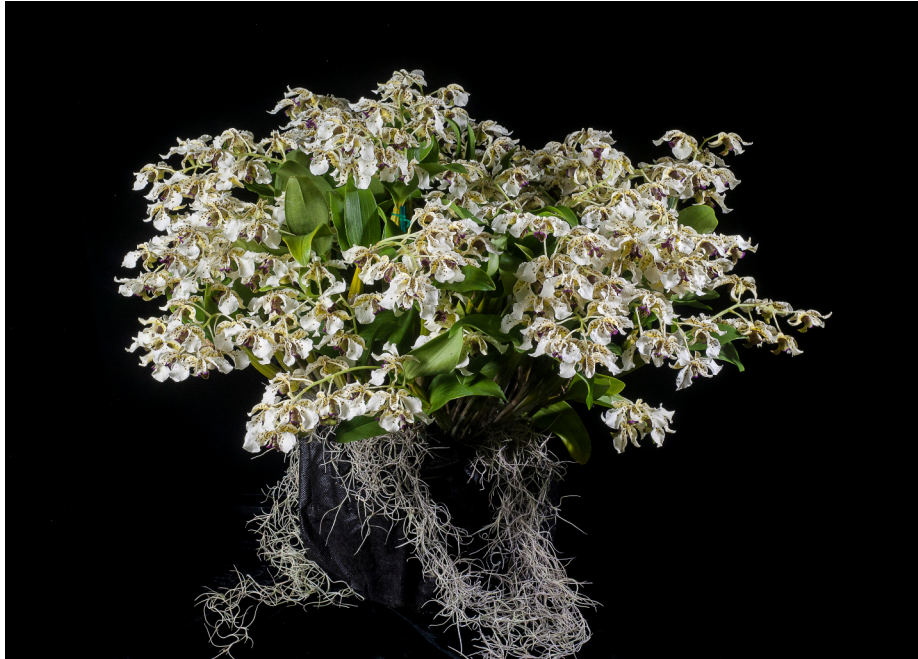
Dendrobium atrovioaceum 'Jeff #1'