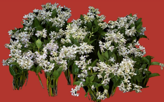
Den. Royal Chip AQ HOS