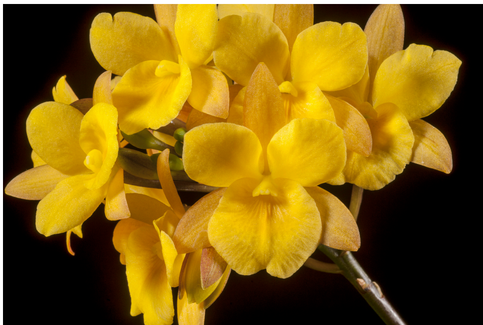
Guaritonia Why Not 'Pee Wee'