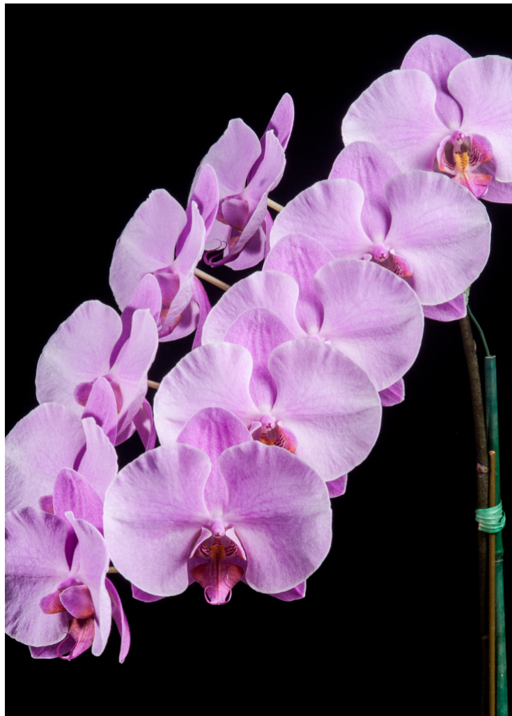
Phalaenopsis Momilani Sweetheart 'Lynne'