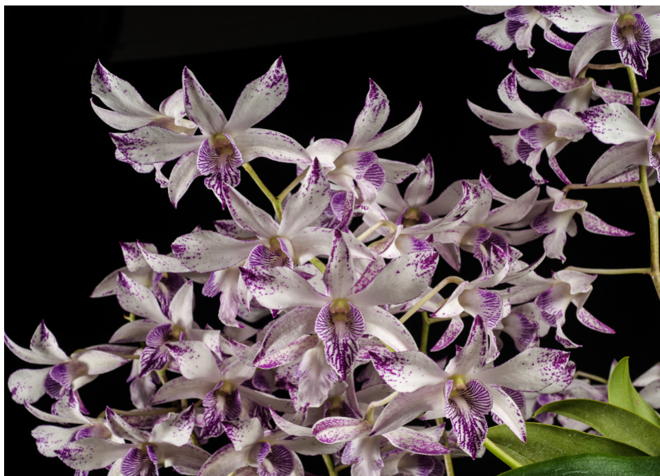
Dendrobium Rising Star 'Mabel'