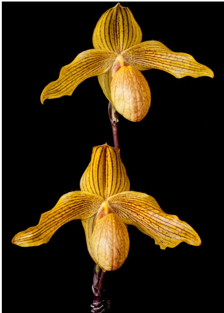
Paphiopedilum Dollgoldi 'Man Hee'