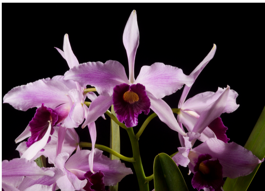
Cattleya purpurata h.f. striata 'H&R Stripes'