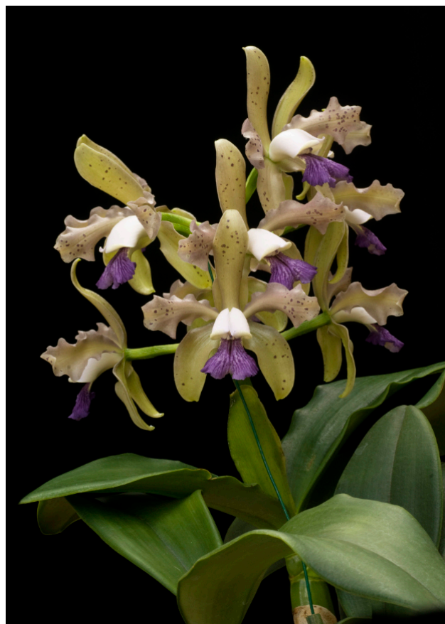
Cattleya Leoloddiglossa 'Evalani'