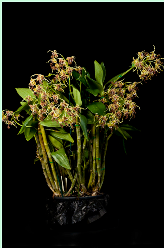
Dendrobium spectabile 'Aileen'