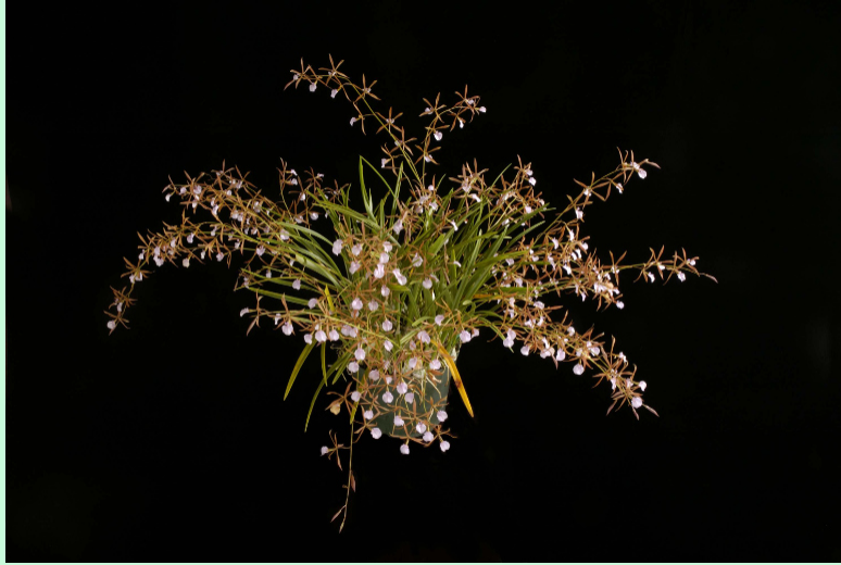
Encyclia bractescens 'Ruth'