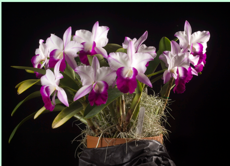
Cattleya Memoria Robert Strait 'Islander Delights'