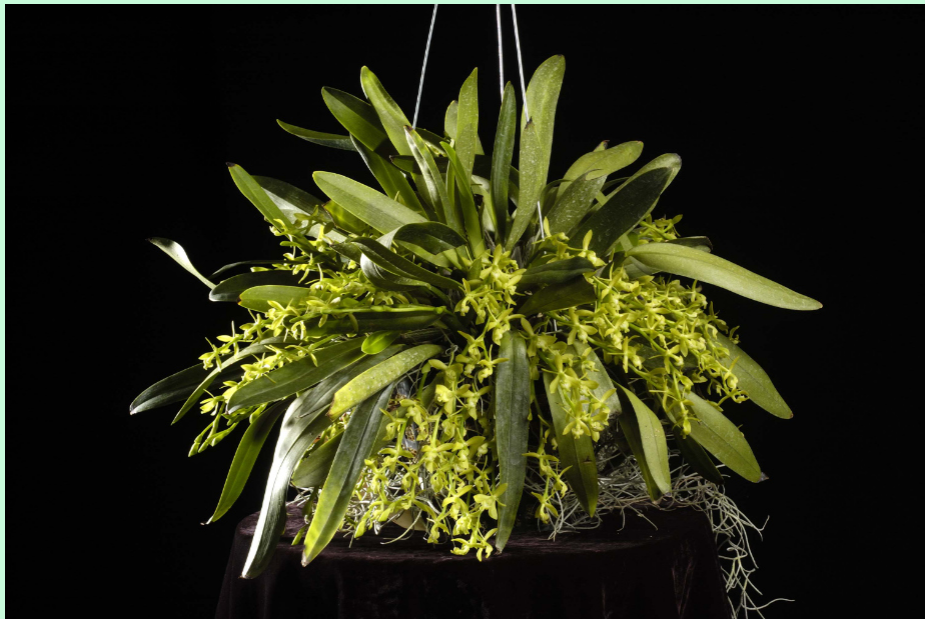
Epidendrum laterale 'Mary Rose'