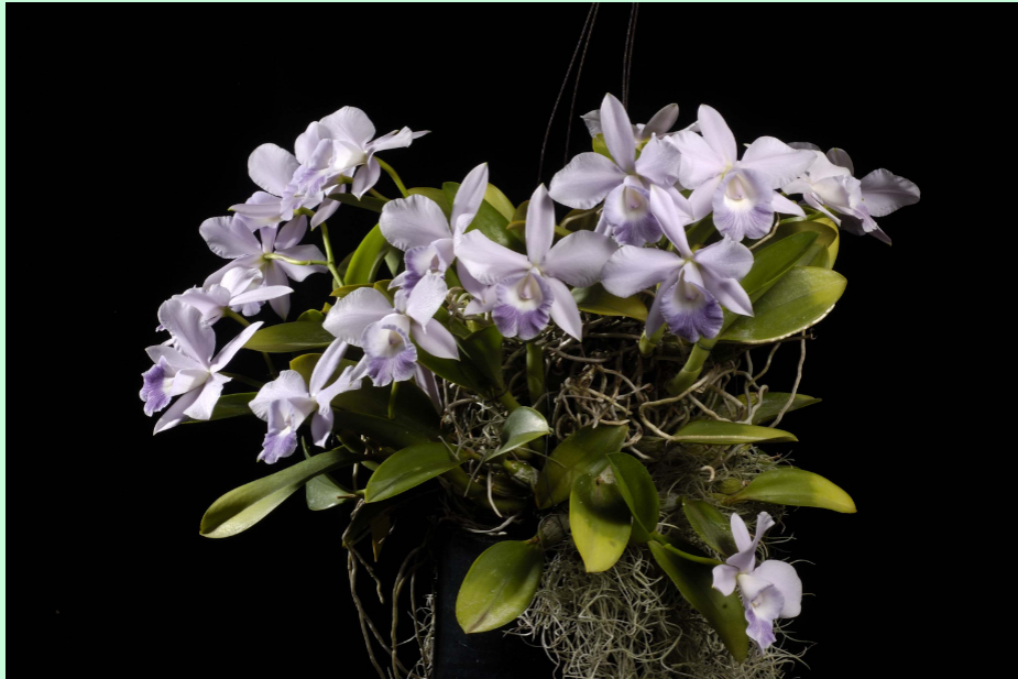
Cattleya Mini Purple 'Blue Hawaii'