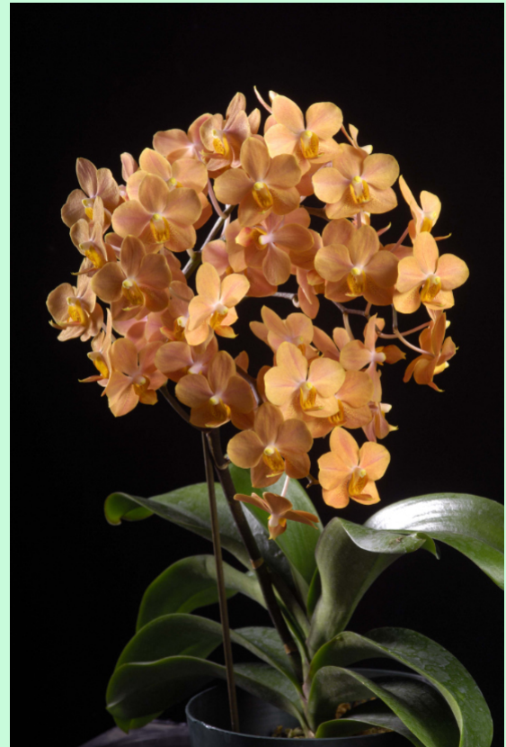
Vandaenopsis Irene Dobkin 'Elmhurst'