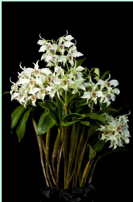
Dendrobium Paul Paquette 'Calvin T. Abe'