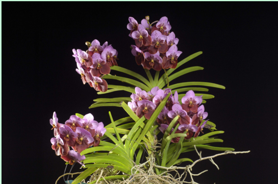
Vanda sanderiana 'Barry Tagawa'

CCM HOS 85.2 pts Owner: S&W Orchids Date: July 10, 2008 Venue: Ewa Orchid Show