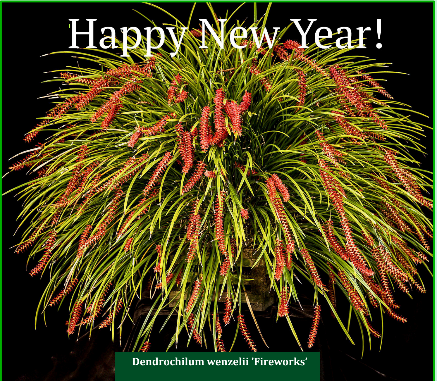
Dendrochilum wenzelii 'Fireworks'