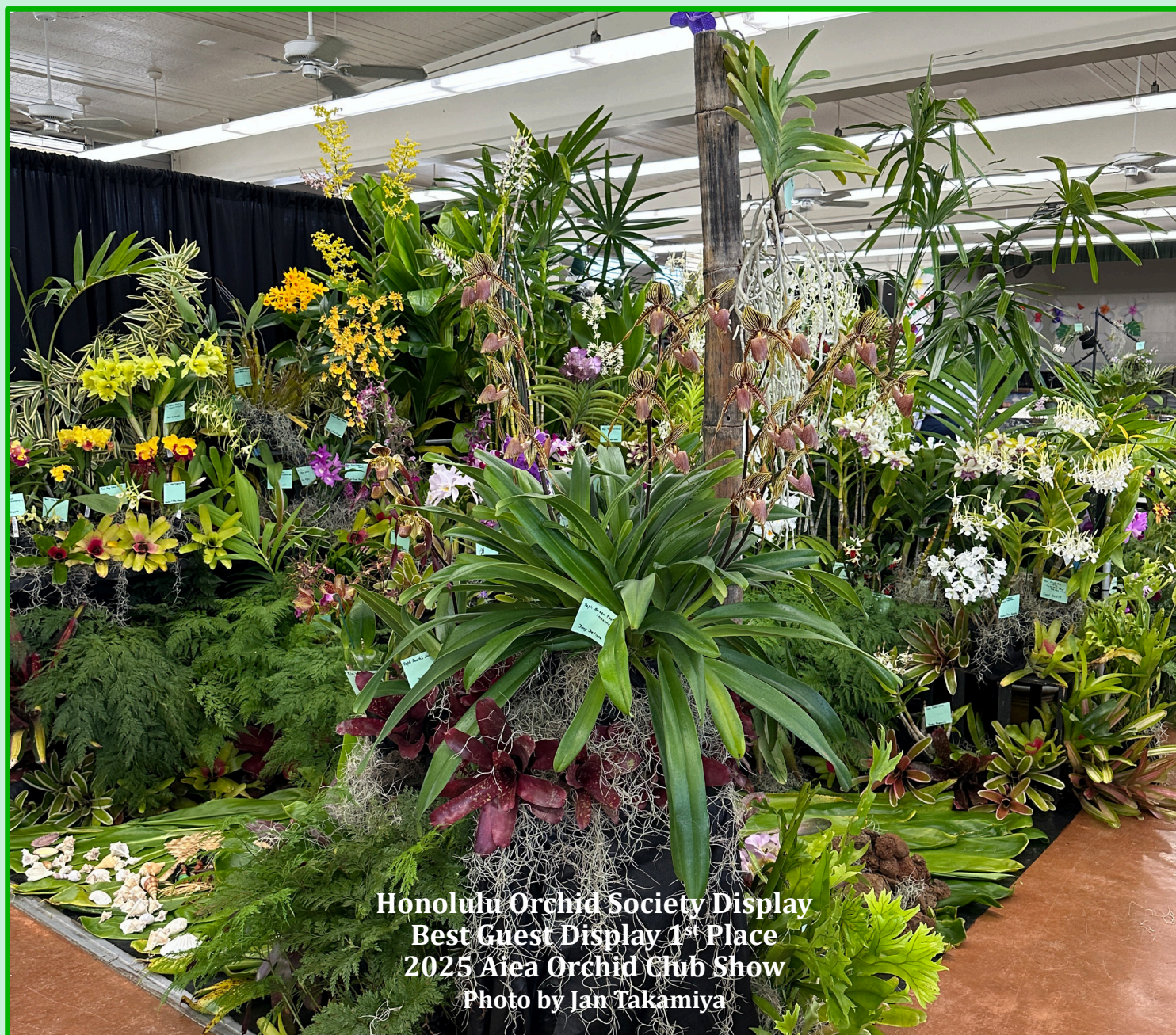
Honolulu Orchid Society Display Best Guest Display 1 st Place 2025 Aiea Orchid Club Show